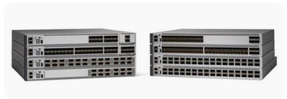
Figure 4. Catalyst 9500 Series

The new Catalyst 9500X model is based on Cisco Silicon One Q200 Application-Specific Integrated Circuit (ASIC), which is purpose built for the next generation core with a programmable pipeline (P4). It is the first network silicon to offer switching capacity up to 25.6 Tbps (12.8 Tbps full-duplex) in the enterprise. The Q200 ASIC offers high-performance along with full routing and switching capabilities without external memories. This is enabled by a multiple slice (discreet processing pipeline) internal architecture that includes an on-chip 2.5D High Bandwidth Memory (HBM). The Catalyst 9500 Series leverages a high-performance multiple core x86 CPU, and is Cisco’s leading purpose-built fixed core and WAN edge services enterprise switching platform, built for security, IoT, and cloud.