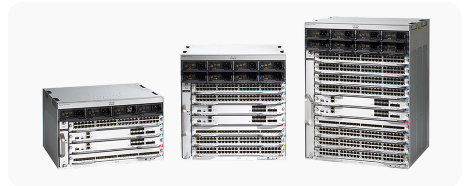
Figure 3. Catalyst 9400 Series