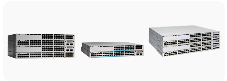
Figure 2. Catalyst 9300 Series